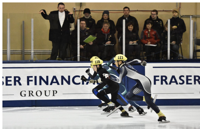
BCST 2016 in Kamloops, B.C.