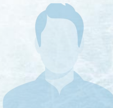
vacant 2 years