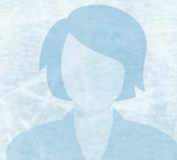
vacant 2 years